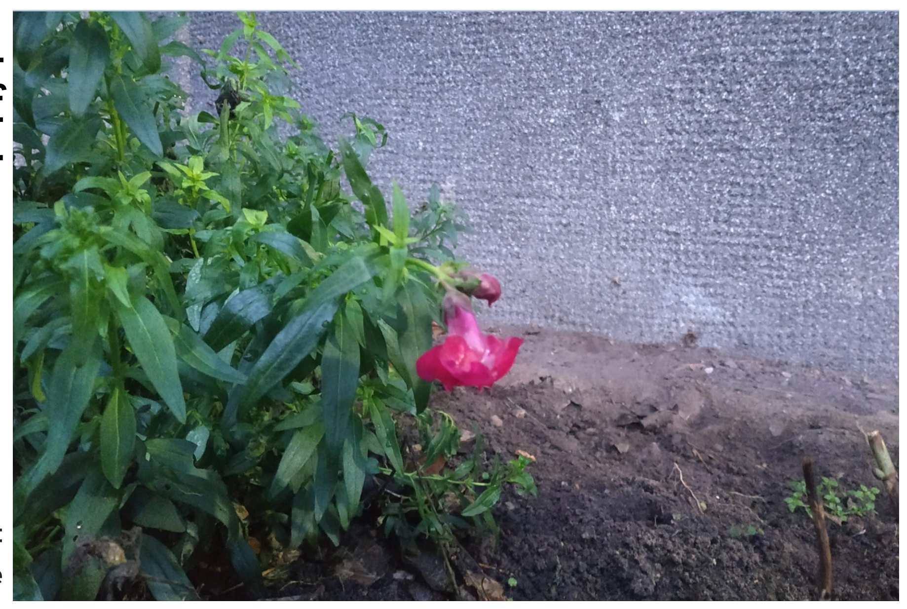
By: Sofija Volungevičiūtė