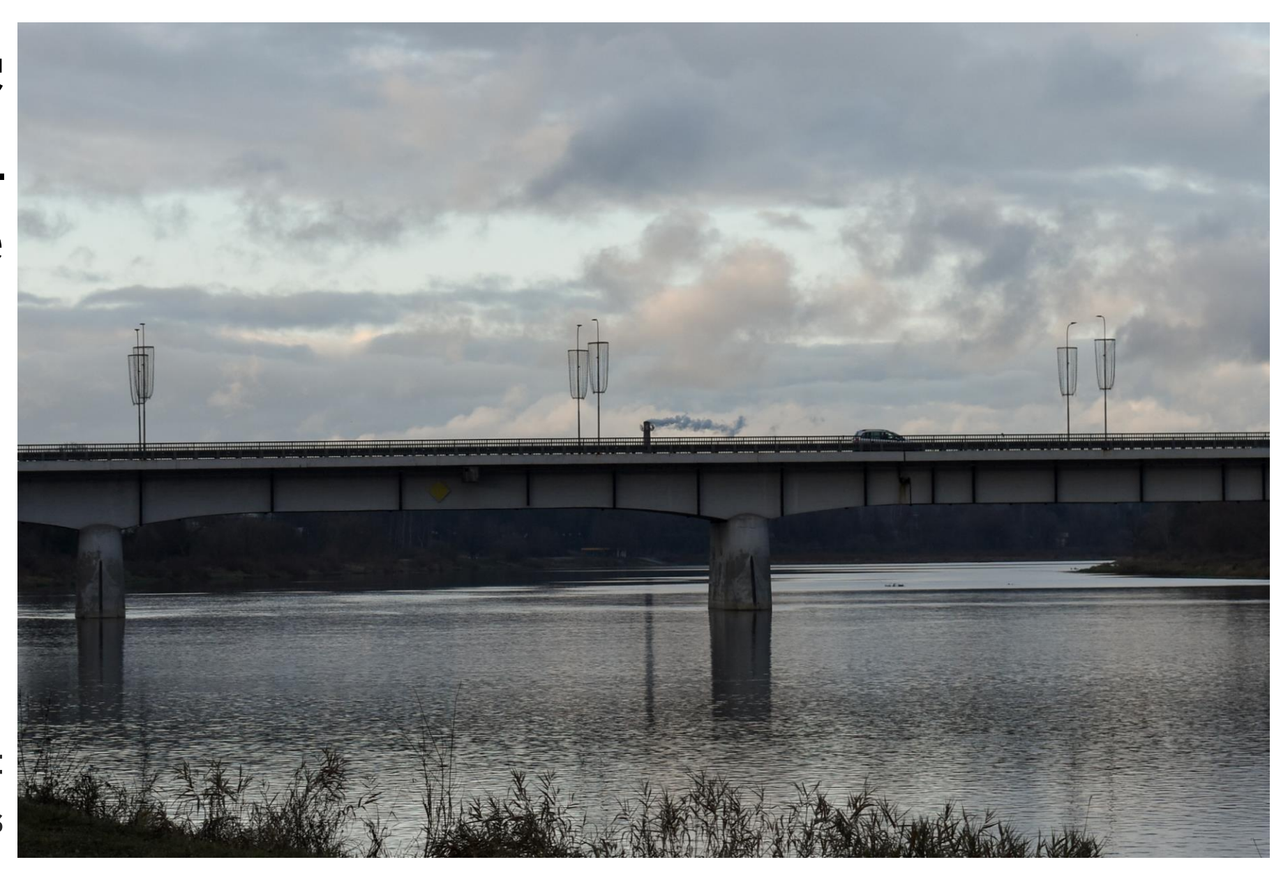
By: Lukas Barkauskas