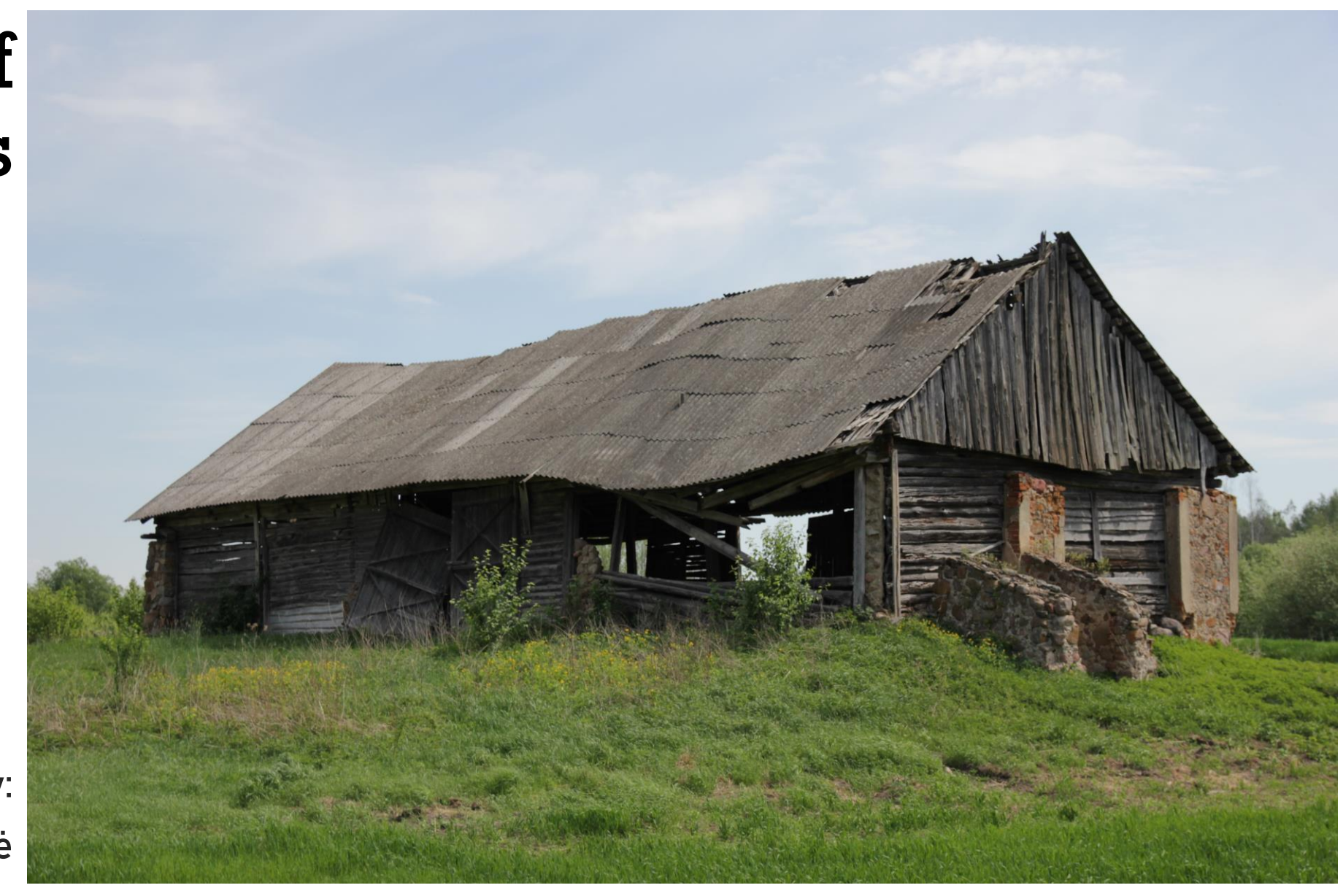
By: Gabija Kuzmickaitė