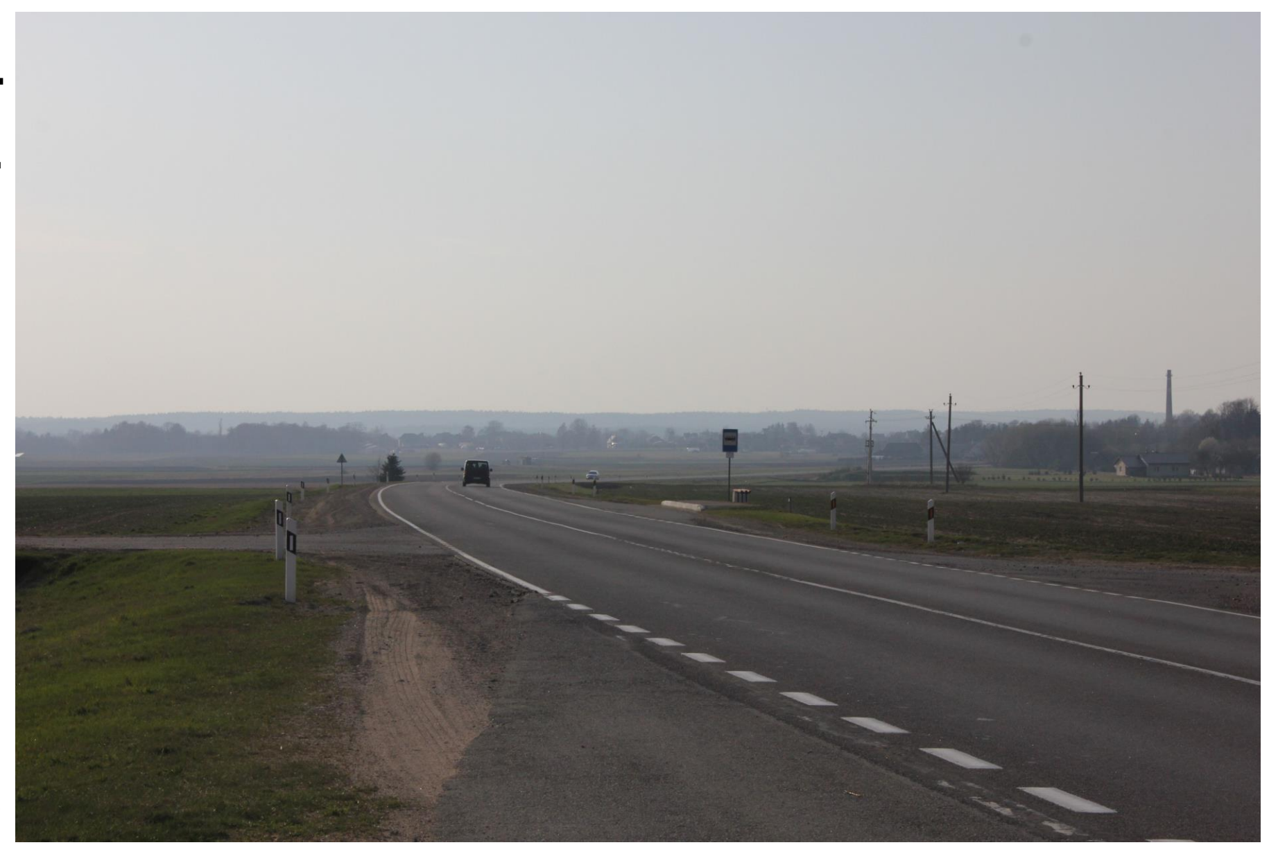
By: Gabija Kuzmickaitė